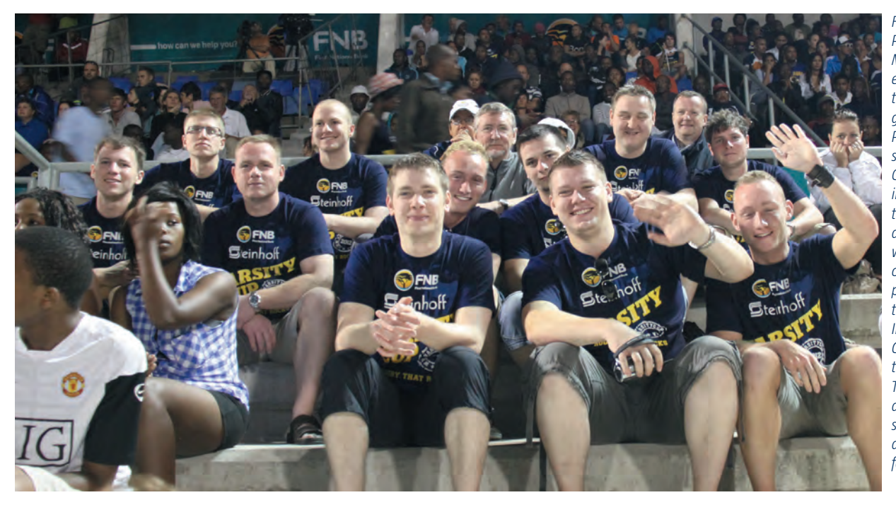
FOREIGN SUP-PORTERS ... The Madibaz had extra support at their Varsity Cup game against Pukke. Eleven students from the Ostfalia University in Germany attended the game during their twoweek visit as part of an exchange programme of the VWSA-DAAD International Chair in Automotive Engineering. The students also attended a workshop on LabView and visited game farms.