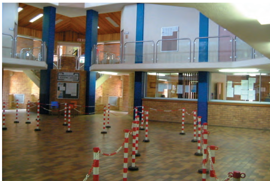
NEW LOOK ... The main student service venue is but one area that has been revamped at Missionvale Campus in recent months.

A Science Centre is currently being finalised in line with long-term plans for the campus.