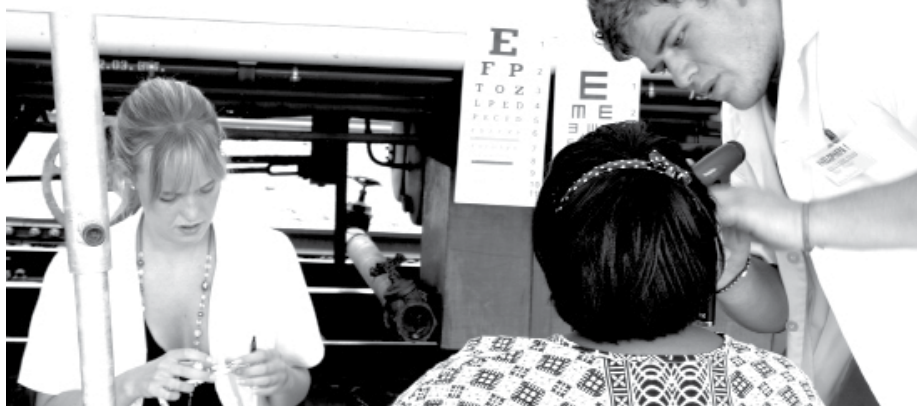
TREATMENT ... The eye clinic is just one part of the health care services provided by Transnet's Phelophepa Health Care Train which our Community Development Unit markets and coordinates in the Eastern Cape.

On 11 March the unit will host a welcome for the train at the beginning of a three-week long stay in the Metro.